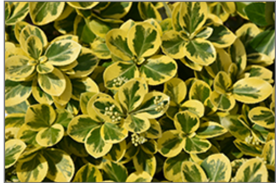
Gold Splash Wintercreeper flower buds

This shrub performs well in both full sun and full shade. It is very adaptable to both dry and moist locations, and should do just fine under typical garden conditions. It is not particular as to soil type or pH. It is highly tolerant of urban pollution and will even thrive in inner city environments, and will benefit from being planted in a relatively sheltered location. This is a selected variety of a species not originally from North America.