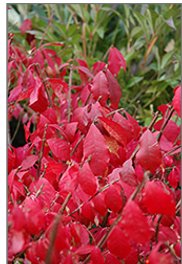
Burning Bush (tree form) in fall