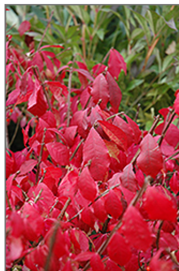
Burning Bush (tree form) in fall