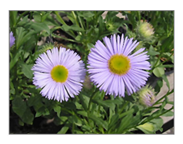
Prosperity Fleabane flowers

Delicate semi-double daisy-like flowers are purple-blue; adaptable to poor dry soils, attracts native butterflies; foliage is somewhat plain, but flowers are ornamental