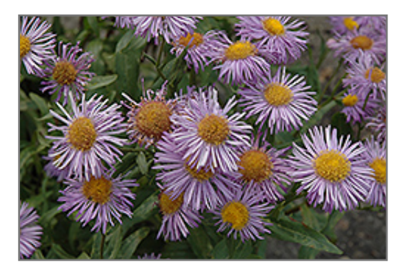
Azure Fairy Fleabane flowers