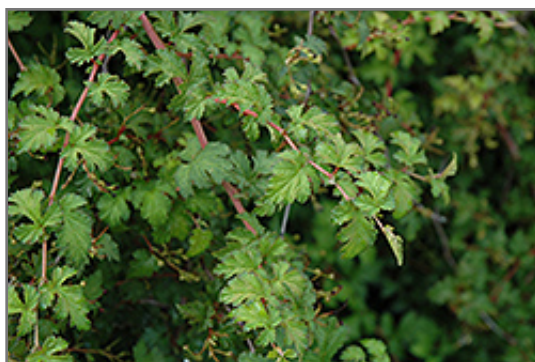
Cutleaf Stephanandra foliage