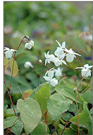
White Bishop's Hat flowers