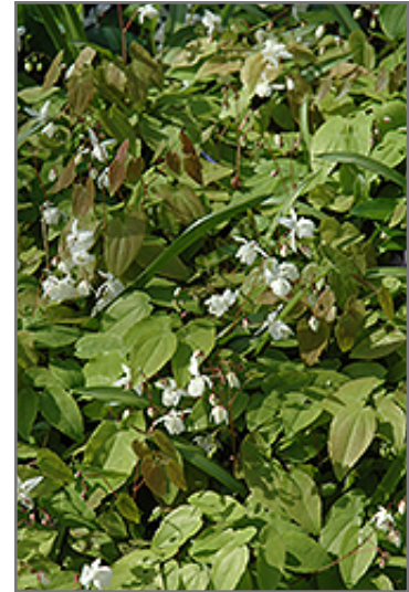
White Bishop's Hat flowers