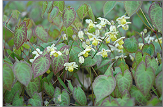
New Yellow Bishop's Hat flowers

Other Names: Barrenwort, Bishop's Hat, Fairy Wings