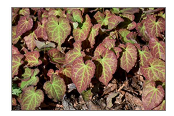
Froehnleiten Bishop's Hat foliage