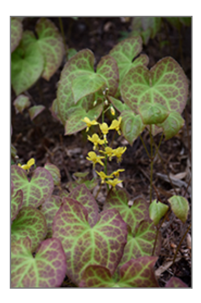
Froehnleiten Bishop's Hat flowers