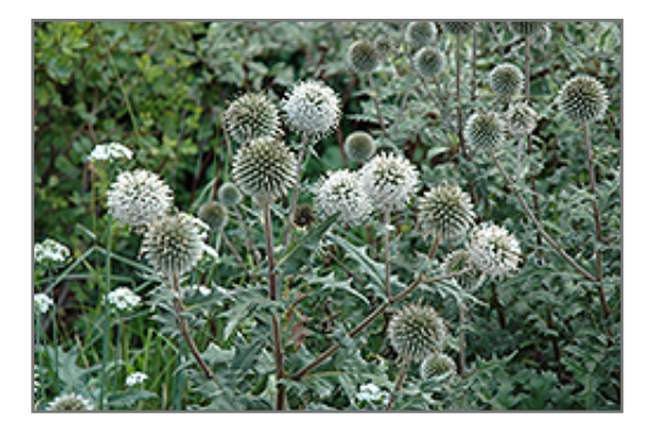
Arctic Glow Globe Thistle flowers

Arctic Glow Globe Thistle will grow to be about 28 inches tall at maturity, with a spread of 18 inches. It grows at a fast rate, and under ideal conditions can be expected to live for approximately 10 years. As an herbaceous perennial, this plant will usually die back to the crown each winter, and will regrow from the base each spring. Be careful not to disturb the crown in late winter when it may not be readily seen!