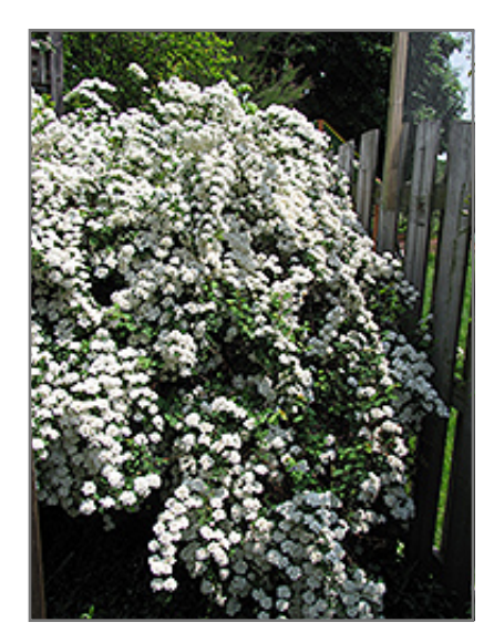
Vanhoutte Spirea in bloom

This shrub will require occasional maintenance and upkeep, and should only be pruned after flowering to avoid removing any of the current season's flowers. It is a good choice for attracting butterflies to your yard, but is not particularly attractive to deer who tend to leave it alone in favor of tastier treats. Gardeners should be aware of the following characteristic(s) that may warrant special consideration;