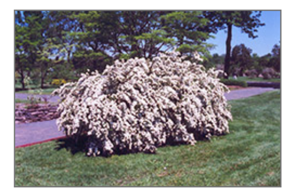
Vanhoutte Spirea in bloom