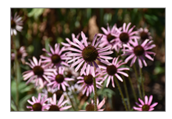
Rocky Top Coneflower flowers

This is a relatively low maintenance plant, and is best cleaned up in early spring before it resumes active growth for the season. It is a good choice for attracting butterflies to your yard, but is not particularly attractive to deer who tend to leave it alone in favor of tastier treats. It has no significant negative characteristics.