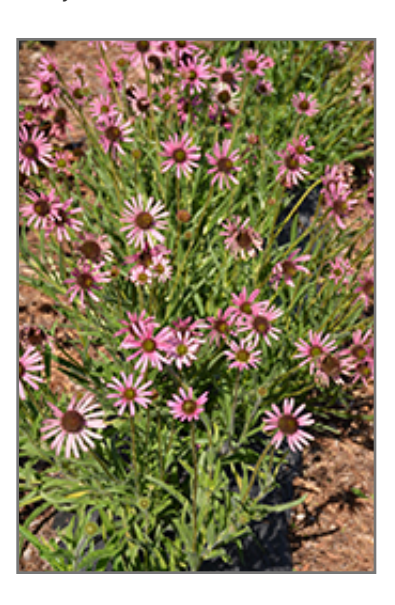
Rocky Top Coneflower in bloom

Rocky Top Coneflower is recommended for the following landscape applications;