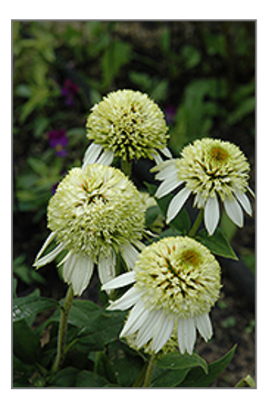
Coconut Lime Coneflower flowers

Coconut Lime Coneflower has masses of beautiful lightly-scented double white pincushion flowers with gold overtones and chartreuse centers at the ends of the stems from mid summer to mid fall, which are most effective when planted in groupings. The flowers are excellent for cutting. Its pointy leaves remain forest green in colour throughout the season.