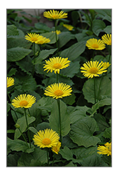
Leonardo Compact Leopard's Bane flowers