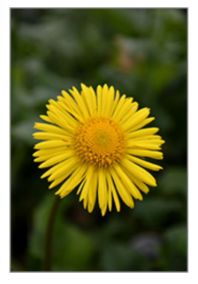
Leonardo Compact Leopard's Bane flowers

Leonardo Compact Leopard's Bane is recommended for the following landscape applications;