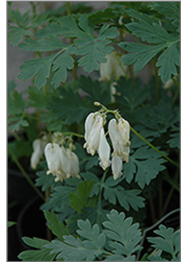
Aurora Bleeding Heart flowers