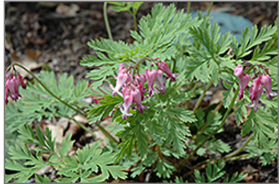
Dolly Sods Bleeding Heart flowers

Dolly Sods Bleeding Heart is recommended for the following landscape applications;