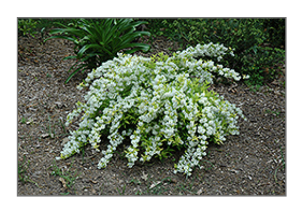
Chardonnay Pearls Deutzia in bloom

Chardonnay Pearls Deutzia is recommended for the following landscape applications;