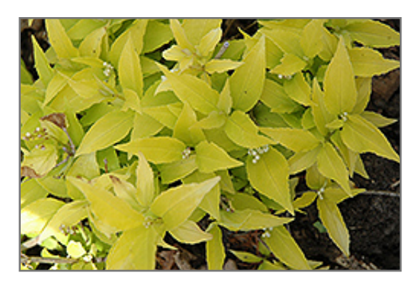
Chardonnay Pearls Deutzia foliage

This shrub should only be grown in full sunlight. It is very adaptable to both dry and moist locations, and should do just fine under typical garden conditions. It is not particular as to soil type or pH. It is highly tolerant of urban pollution and will even thrive in inner city environments. This is a selected variety of a species not originally from North America.