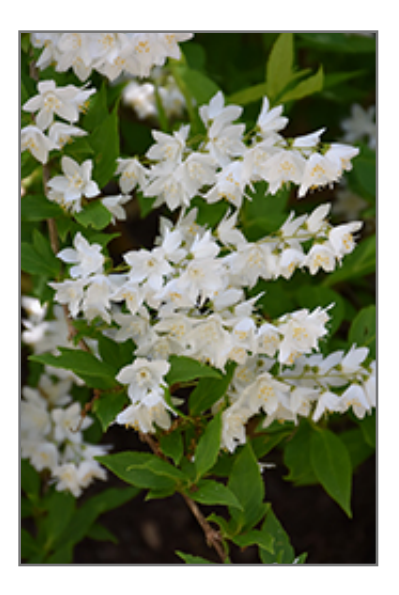
Chardonnay Pearls Deutzia flowers