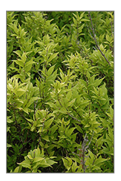
Golden Deutzia foliage