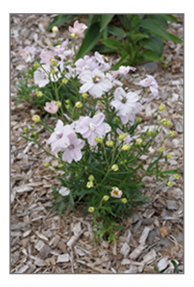
Summer Morning Delphinium in bloom