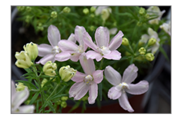
Summer Morning Delphinium flowers

This plant will require occasional maintenance and upkeep, and should be cut back in late fall in preparation for winter. It is a good choice for attracting bees, butterflies and hummingbirds to your yard. Gardeners should be aware of the following characteristic(s) that may warrant special consideration;