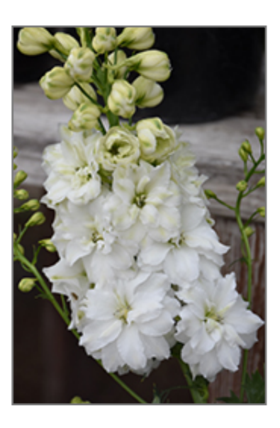
Green Twist Larkspur flowers

Magnificent display of double white flowers on towering spikes; flowers are beautifully dappled with scrumptious apple-green markings; good vertical form, dense flower spikes, strong stems; excellent uniformity