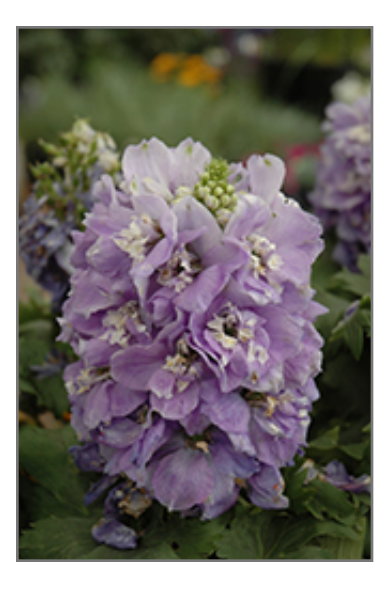
Aurora Lavender Larkspur flowers

Magnificent display of compact lavender flowers on towering spikes; good vertical form, dense flower spikes, strong stems; excellent uniformity