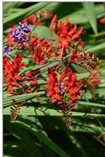
Lucifer Crocosmia flowers

Lucifer Crocosmia is recommended for the following landscape applications;