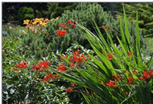
Lucifer Crocosmia in bloom