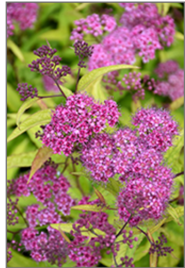
Flaming Mound Spirea flowers

This shrub will require occasional maintenance and upkeep, and is best pruned in late winter once the threat of extreme cold has passed. It is a good choice for attracting butterflies to your yard, but is not particularly attractive to deer who tend to leave it alone in favor of tastier treats. It has no significant negative characteristics.