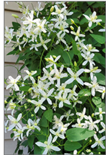
Sweet Autumn Clematis flowers