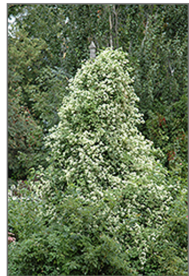
Sweet Autumn Clematis in bloom