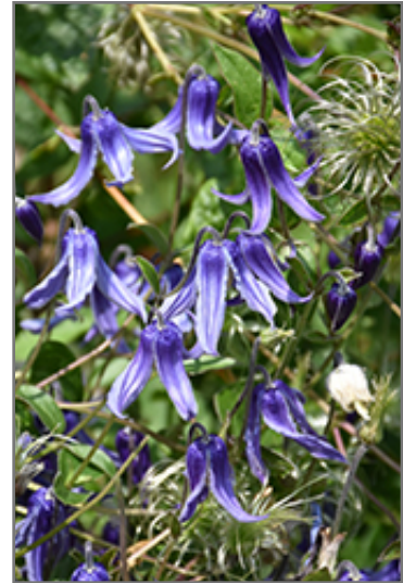
Solitary Clematis flowers