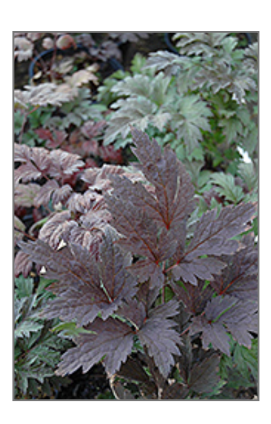
Brunette Bugbane foliage

Brunette Bugbane is blanketed in stunning spikes of fragrant white flowers with shell pink overtones rising above the foliage from mid to late summer. The flowers are excellent for cutting. Its attractive deeply cut compound leaves emerge burgundy in spring, turning dark green in colour throughout the season. The brown fruits are carried on spikes from late summer to late winter. The deep purple stems are very colorful and add to the overall interest of the plant.