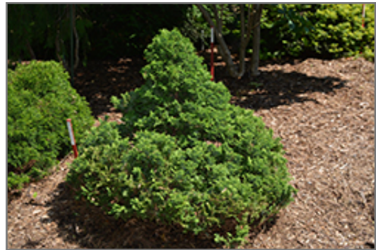
Dwarf Moss Falsecypress