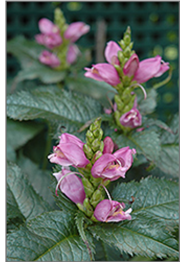
Hot Lips Turtlehead flowers

Hot Lips Turtlehead is recommended for the following landscape applications;