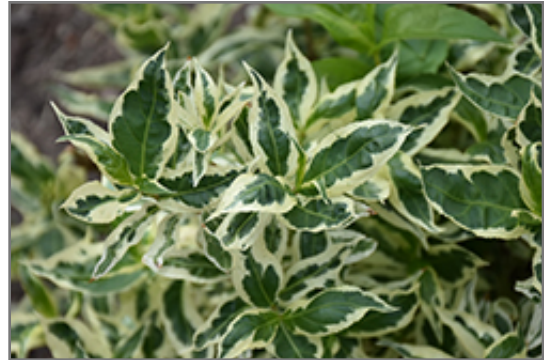
Cool Splash Bush Honeysuckle foliage