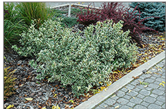
Cool Splash Bush Honeysuckle