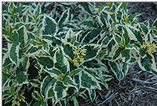
Cool Splash Bush Honeysuckle flowers

Cool Splash Bush Honeysuckle is a dense multi-stemmed deciduous shrub with a shapely form and gracefully arching branches. Its average texture blends into the landscape, but can be balanced by one or two finer or coarser trees or shrubs for an effective composition.