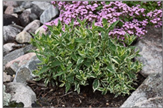
Cool Splash Bush Honeysuckle