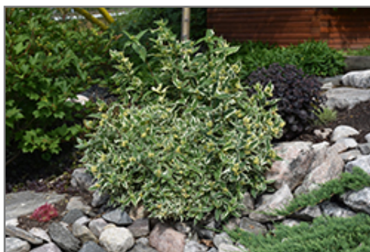
Cool Splash Bush Honeysuckle