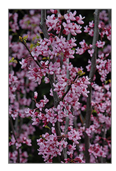
Texas Redbud flowers