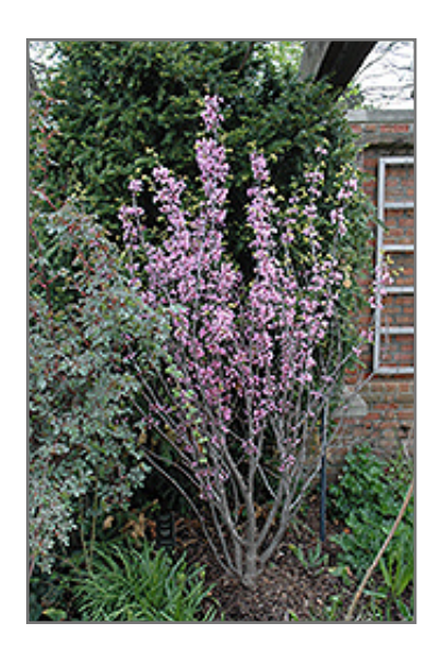
Texas Redbud in bloom