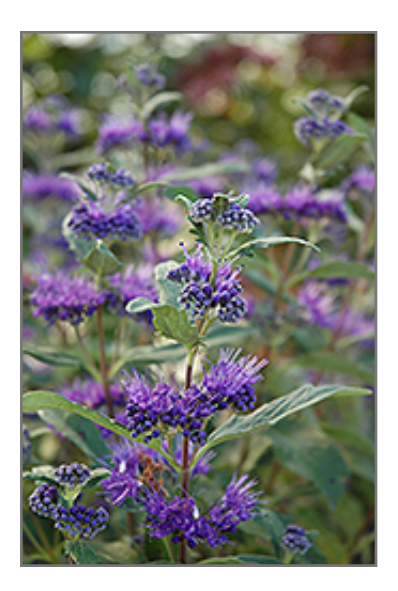
Dark Knight Caryopteris flowers