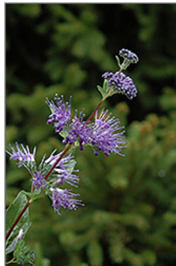
Blue Mist Caryopteris flowers

Blue Mist Caryopteris is recommended for the following landscape applications;