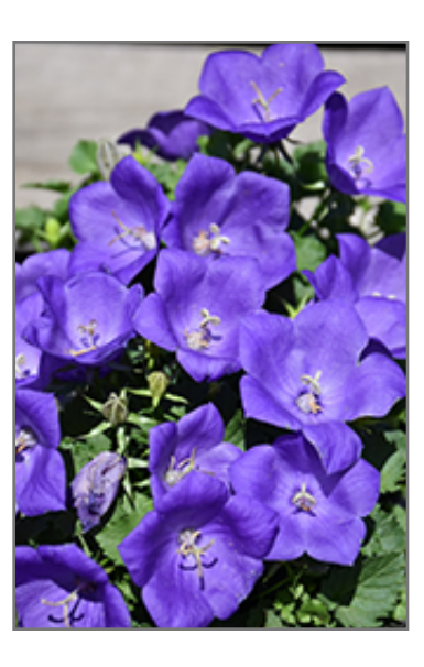
Pearl Light Blue Bellflower flowers

Pearl Light Blue Bellflower is blanketed in stunning powder blue bell-shaped flowers at the ends of the stems from late spring to late summer. Its round leaves remain dark green in colour throughout the season.