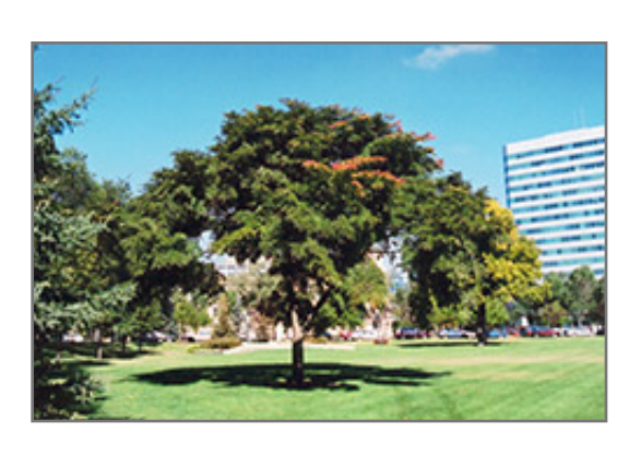
Japanese Elm

A medium sized tree with an artistic, spreading habit of growth and pendant branches, beautiful when mature; hardy and adaptable, notably smaller than American elm, makes a great lawn tree for home landscapes; resistant to Dutch elm disease