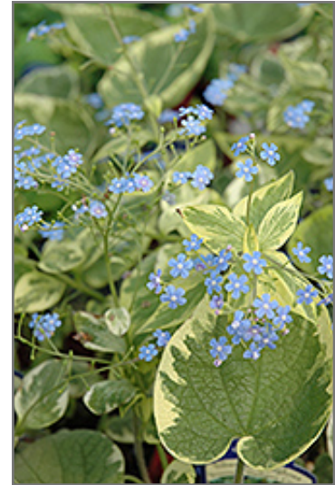
Hadspen Cream Bugloss flowers

Hadspen Cream Bugloss is recommended for the following landscape applications;