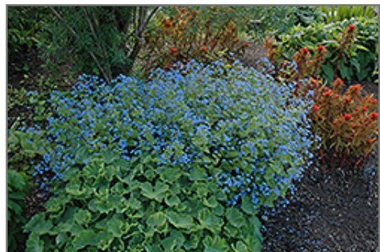
Hadspen Cream Bugloss in bloom