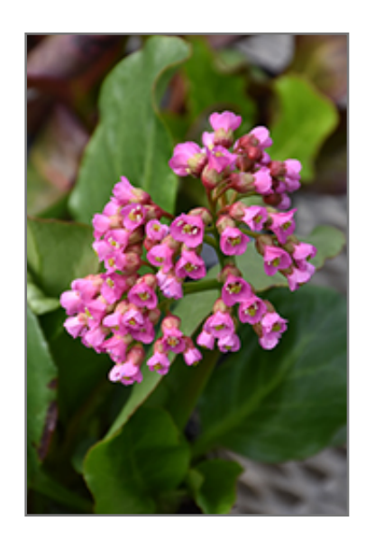
Winter Glow Bergenia flower buds