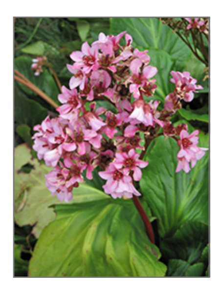
Winter Glow Bergenia flowers