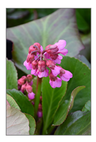
Bressingham Ruby Bergenia flowers