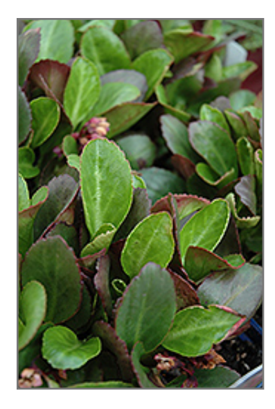
Bressingham Ruby Bergenia foliage