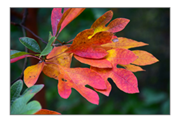
Sassafras in fall