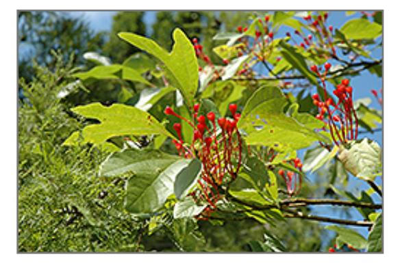
Sassafras flowers

Sassafras will grow to be about 50 feet tall at maturity, with a spread of 30 feet. It has a high canopy with a typical clearance of 6 feet from the ground, and should not be planted underneath power lines. As it matures, the lower branches of this tree can be strategically removed to create a high enough canopy to support unobstructed human traffic underneath. It grows at a medium rate, and under ideal conditions can be expected to live for 70 years or more.