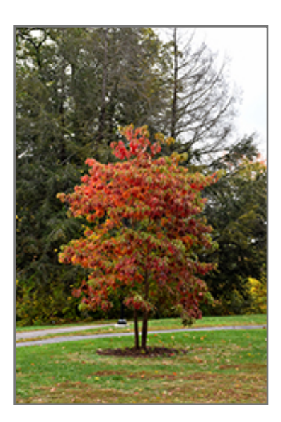
Sassafras in fall

This tree will require occasional maintenance and upkeep, and is best pruned in late winter once the threat of extreme cold has passed. It is a good choice for attracting birds to your yard, but is not particularly attractive to deer who tend to leave it alone in favor of tastier treats. Gardeners should be aware of the following characteristic(s) that may warrant special consideration;