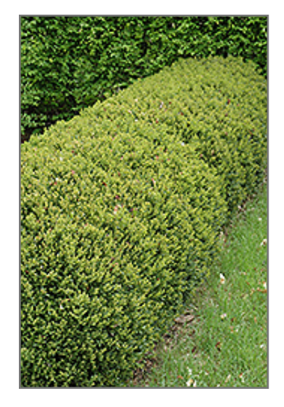
Green Gem Boxwood