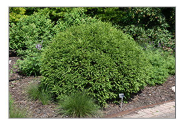
Green Gem Boxwood