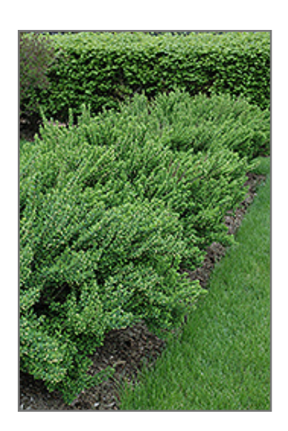
Upright Japanese Barberry