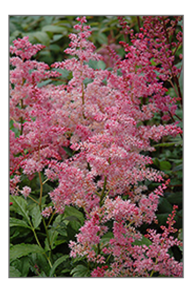
Jump and Jive Astilbe flowers