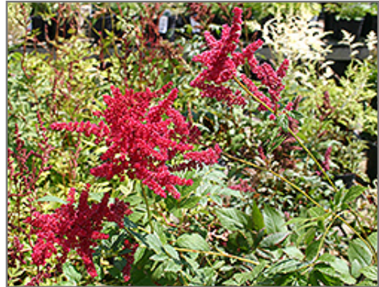
Glow Astilbe flowers