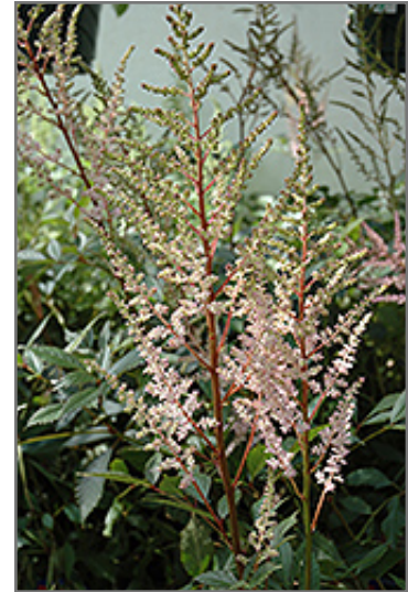
Erica Astilbe flowers