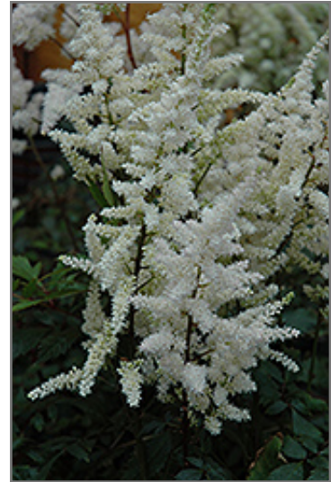
Bumalda Astilbe flowers