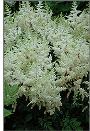
Ellie Japanese Astilbe flowers