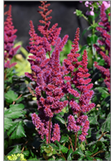
Visions in Red Chinese Astilbe flowers