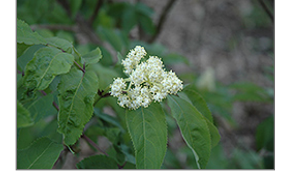
American Elder flowers

This is a high maintenance shrub that will require regular care and upkeep, and is best pruned in late winter once the threat of extreme cold has passed. It is a good choice for attracting birds to your yard. Gardeners should be aware of the following characteristic(s) that may warrant special consideration;