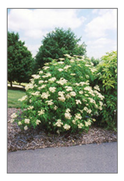
American Elder in bloom