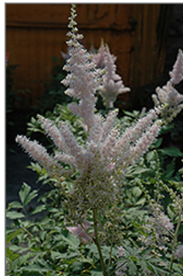
Milk and Honey Astilbe flowers