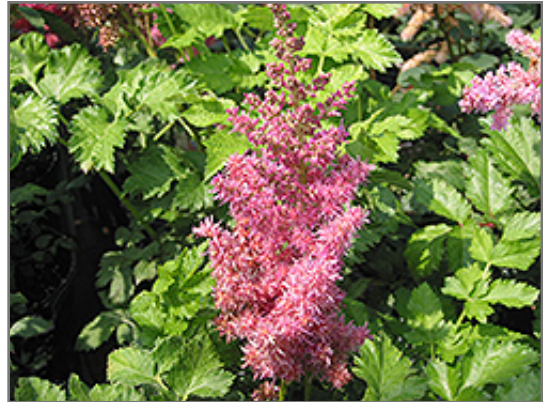
Stand and Deliver Astilbe flowers