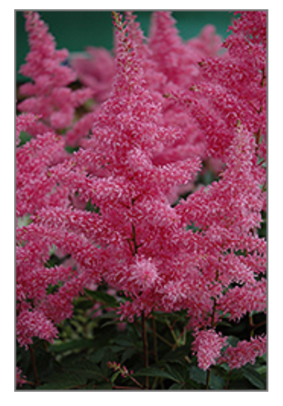
Rhythm and Blues Astilbe flowers

Soft, showy plumes of raspberry pink, rising above glossy leaves; perfect in a shady spot with dappled light; prefers moisture so water regularly for abundant flowers and nice foliage