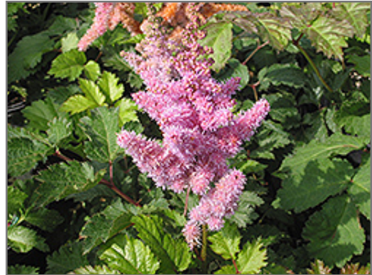
Heart and Soul Astilbe flowers